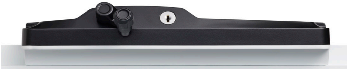
Awning Winder – Colour matched as standard